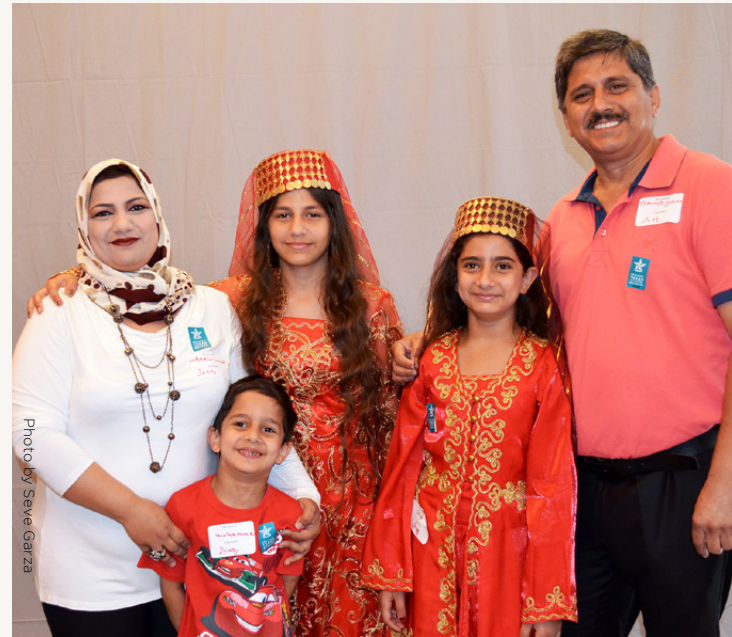
A family poses for the camera during World Refugee Day

Partnering with community organizations reinforces our shared mission of interpreting history and introduces the museum to new audiences. Partnerships range from exhibition development with St. Edward's University faculty and students, and the Briscoe Center for American History at the University of Texas. We also hosted spectacular live music and film programs organized in conjunction with the Austin Federation of Musicians, Texas Folklife, and Austin Film Festival. The Bullock Museum celebrated its 5th annual sponsorship of Austin's World Refugee Day, a collaboration with Austin's Refugee Roundtable.