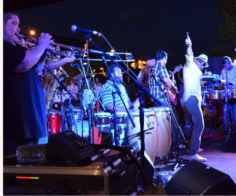
Grupo Fantasma performs during Music Under The Star

history. Two Family Days for this film and Rocky Mountain Express offered more hands-on activities for families and garnered remarkable attendance numbers.