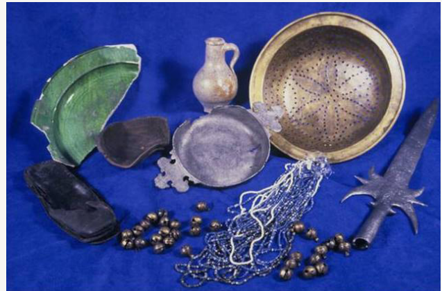
Artifacts recovered from the shipwreck of La Belle

In preparation for the installation of the 17th century French shipwreck, La Belle beginning in October 2014, staff is readying storage space for the arrival of the ship's hull timbers. Renovation of the entire first floor of exhibits will be completed in November 2015. Over the past fiscal year, museum staff and members of the La Belle project team have focused on further development of the exhibition areas surrounding La Belle to ensure a cohesive overall visitor experience on the Bullock Museum's first floor.